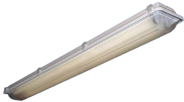
Mounting Brackets Included

The FGVP is available with a stainless steel external hanging bracket. FGVP Series is watertight and must be drilled and sealed for each surface mounting or chain hanging application.